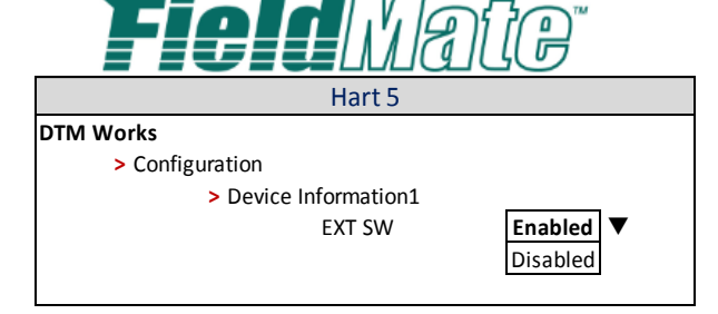
Figure 2: External Digital Encoder location