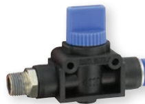
A-4022 Valves: Tubing to Male NPT with Extension